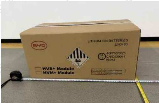
包装正面外观 Front appearance of Packaging