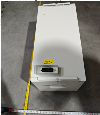
电池侧面外观 Battery side appearance