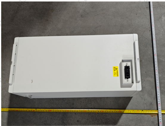
电池正面外观 Battery front appearance